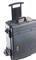
1560MWF With Foam