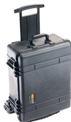
1560MNF No Foam