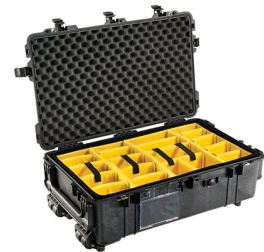
1674 With Padded Dividers