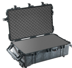
1670WF With Foam