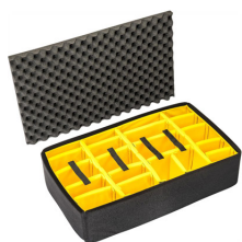
1675 Padded Divider Set