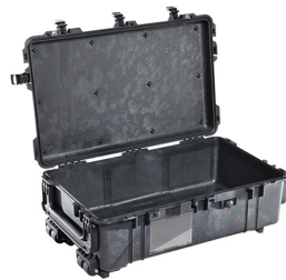
1670NF No Foam