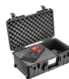
1535AIRTPF TrekPak / Foam Hybrid