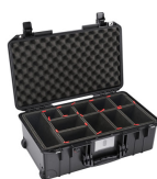
1535TP With TrekPak Divider System