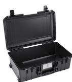
1535NF No Foam