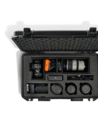
1535AV Universal Camera