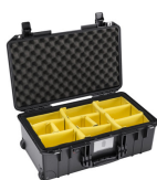
1535WD With Padded Dividers