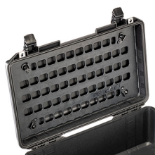
1535MP EZ-Click™ MOLLE Panel