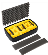
1535AirDS Padded Divider Set