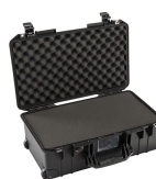
1535WF With Foam