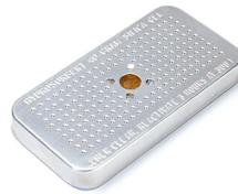
1500D Gel de silice dessicant