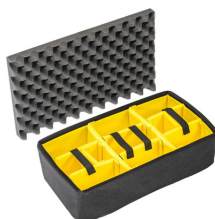
1515 Cloison en mousse