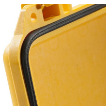
1513 Joint torique de remplacement