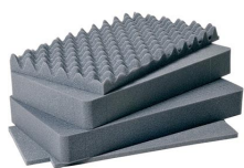
1511 Jeu de mousses de rechange, 4 pièces