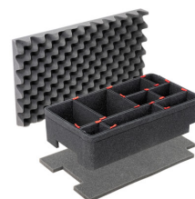
1510TPKIT Kit de séparation de la valise TrekPak