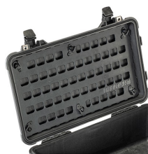
1510MP EZ-Click™ MOLLE Panel