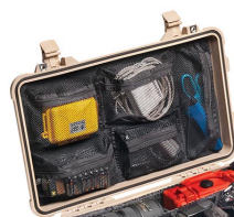
1519 Pochette couvercle