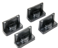
1507QM Supports rapides - jeu de 4