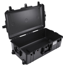
1615NF No Foam