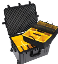
1637WD With Padded Dividers