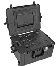
WINE-12B 12-Bottle Wine