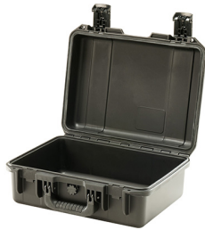
iM2200-X0000 No Foam