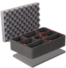
iM2200TPKIT TrekPak Case Divider Kit