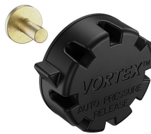
22-IM-VALVE Storm Case Automatic Purge Valve