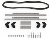
iM2306-BEZEL-LID Lid Bezel Kit