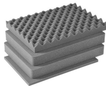
iM2400-FOAM 4 pc. Replacement Foam Set