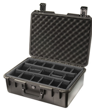
iM2600-X0002 With Padded Dividers