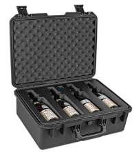
WHISKY-MULTIB Quad Whiskey