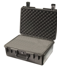
iM2600-X0001 With Foam