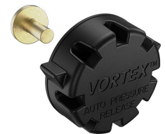
22-IM-VALVE Storm Case Automatic Purge Valve