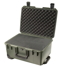
iM2620-X0001 With Foam