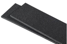
iM2620TPDIV Extra TrekPak Dividers