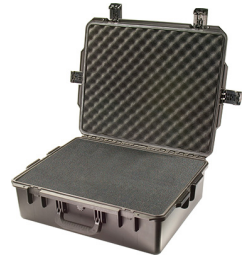
iM2700-X0001 With Foam