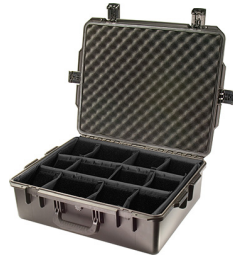
iM2700-X0002 With Padded Dividers