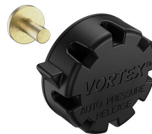
22-IM-VALVE Storm Case Automatic Purge Valve