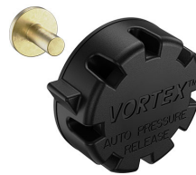
22-IM-VALVE Storm Case Automatic Purge Valve