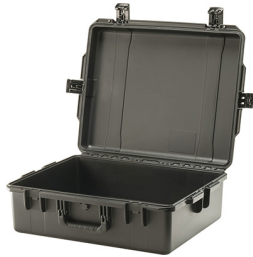
iM2700-X0000 No Foam