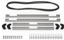
iM2700-BEZEL-LID Lid Bezel Kit