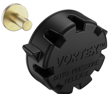
22-IM-VALVE Storm Case Automatic Purge Valve