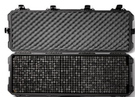
iM3200PRS iM3100 & iM3200 Storm RE- SET Kit