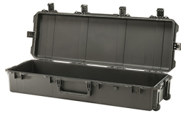
iM3220-X0000 No Foam