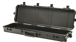
iM3300-X0000 No Foam