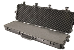
iM3300-X0001 With Foam