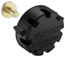
22-IM-VALVE Storm Case Automatic Purge Valve