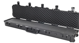
iM3410-X0001 With Foam