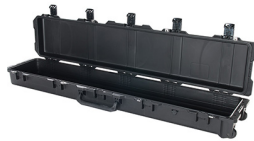
iM3410-X0000 No Foam