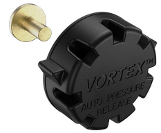
22-IM-VALVE Storm Case Automatic Purge Valve