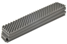
iM3410-FOAM 4 pc. Replacement Foam Set