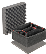
iM2275TPKIT TrekPak Case Divider Kit