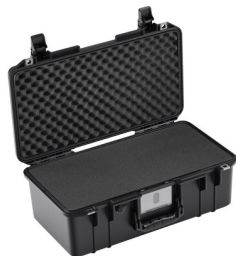
1506WF With Foam