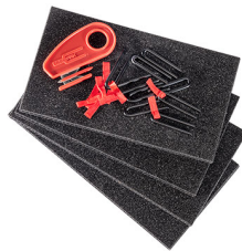
1506TPKIT TrekPak Case Divider Kit