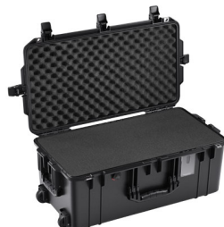
1606WF With Foam