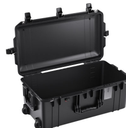
1606NF No Foam