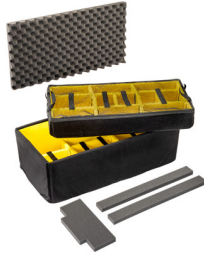
1626AirDS Padded Divider Set