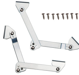
KIT-LIDSTAY-CARGO Cargo Lid Stays