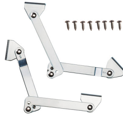
KIT-LIDSTAY-CARGO Cargo Lid Stays