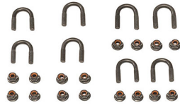
RFMTTC2 Roof Mount Tubular Clamp Kit