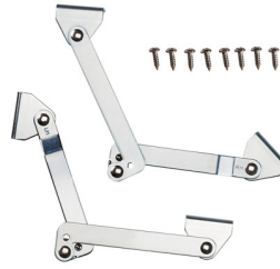
KIT-LIDSTAY-CARGO Cargo Lid Stays