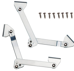
KIT-LIDSTAY-CARGO Cargo Lid Stays