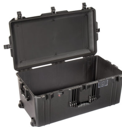
1646NF No Foam