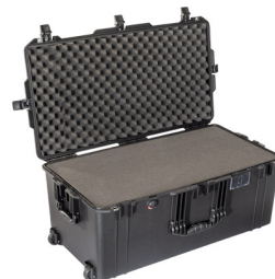
1646WF With Foam