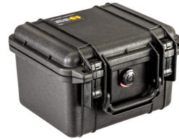
1300NF No Foam