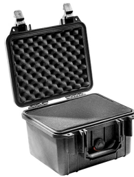
1300WF With Foam