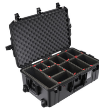
1595TP With TrekPak Divider System