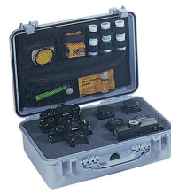
1508 Photographer's Lid Organizer