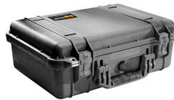
1500NF No Foam