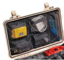
1519 Lid Organizer