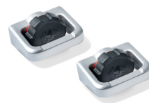
BARLP CRATE ModRail BarLoop