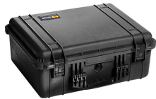
1550NF No Foam