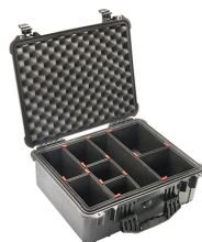
1550TP With TrekPak Divider System