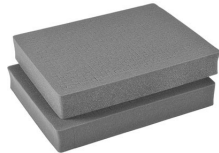
1552 Pick N Pluck™ Sections Only (set of 2)