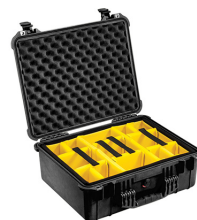
1554 With Padded Dividers