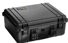
1550NF No Foam