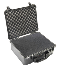
1550WF With Foam