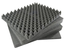
1651 4 pc. Replacement Foam Set