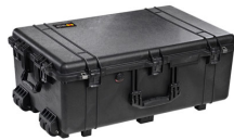
1650NF No Foam