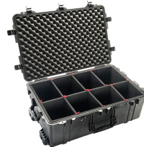
1650TP With TrekPak Divider System