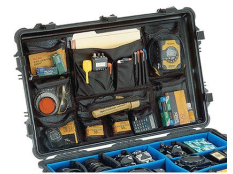
1659 Photo/Lid Organizer