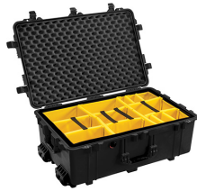
1654 With Padded Dividers