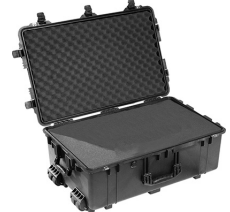
1650WF With Foam