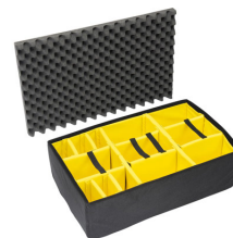
1655 Padded Divider Set