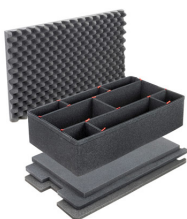
1650TPKIT TrekPak Case Divider Kit