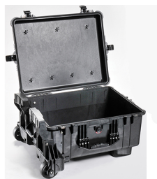
1610MNF No Foam