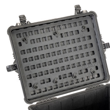
1610MP EZ-Click™ MOLLE Panel