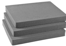
1612 Pick N Pluck™ Sections Only (set of 3)