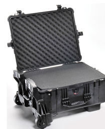
1610MWF With Foam