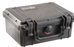
1150NF No Foam