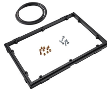
1150PF Special Application Panel Frame