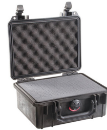
1150WF With Foam