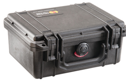
1150NF No Foam