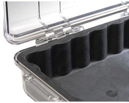
1011 Replacement Case Liner