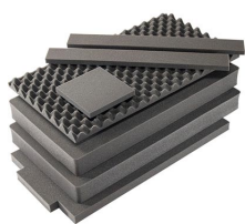
1615AirFS 7 pc. Replacement Foam Set