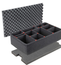
1615TPKIT TrekPak Case Divider Kit