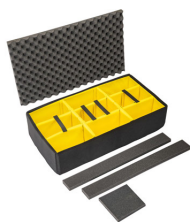
1615AirDS Padded Divider Set