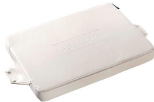
50Q-SEAT-WHT Seat Cushion - White