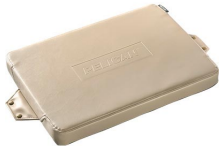
50Q-SEAT-TAN Seat Cushion - Tan