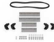
iM20XX-M4-BEZEL Base Bezel Kit (Metric)