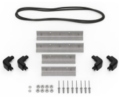
iM20XX-BEZEL Base Bezel Kit