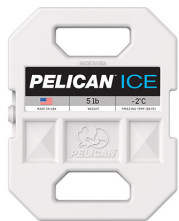
PI-5LB 5lb Ice Pack