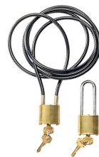
CL2 Cable Lock (2 pack)