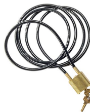
CL1 Cable Lock