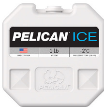
PI-1LB 1lb Ice Pack