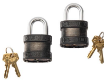
PL2 Padlock (2 pack)