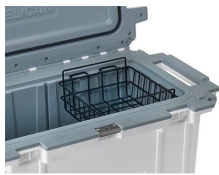
70-WB Dry Rack Basket