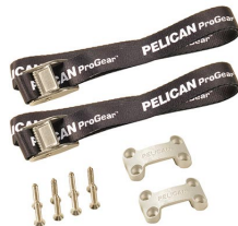
TDKIT Tie Down Kit

23215 Early Ave • Torrance, CA 90505 USA • Phone: (310) 326-4700 • (800) 473-5422 • Fax: (310) 326-3311 sales@pelican.com • www.pelican.com