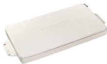
70Q-SEAT-WHT Seat Cushion - White