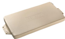
70Q-SEAT-TAN Seat Cushion - Tan