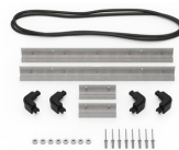
iM2306-BEZEL Base Bezel Kit