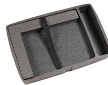
iM2370-COMPTRAY Computer Tray