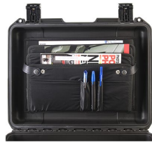
iM24XX-LIDORG Lid Organizer