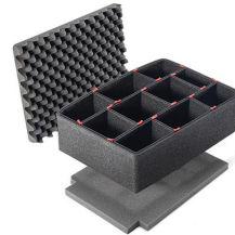
iM2450TPKIT TrekPak Case Divider Kit