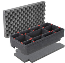
iM2500TPKIT TrekPak Case Divider Kit