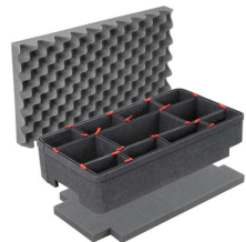
iM2500TPKIT TrekPak Case Divider Kit