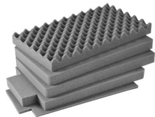
iM2500-FOAM 5 pc. Replacement Foam Set