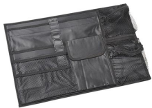
iM2500-UTILITYORG Utility Organizer