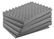
iM2600-FOAM 5 pc. Replacement Foam Set