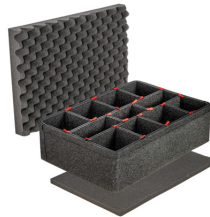
iM2600TPKIT TrekPak Case Divider Kit