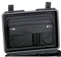
iM26XX-LIDORG Lid Organizer