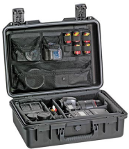
iM26XX-PHOTOPALLET Photography Pallet