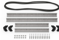
iM2620-BEZEL Base Bezel Kit