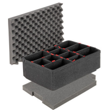
iM2620TPKIT TrekPak Case Divider Kit