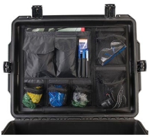
iM27XX-UTILITYORG Utility Organizer