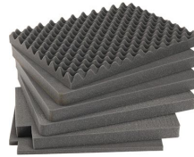
iM2720-FOAM 6 pc. Replacement Foam Set