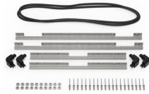
iM2720-BEZEL-LID Lid Bezel Kit