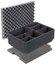
iM2720TPKIT TrekPak Case Divider Kit