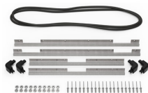
iM2750-BEZEL-LID Lid Bezel Kit