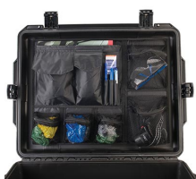
iM27XX-UTILITYORG Utility Organizer