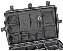
iM2875-UTILITYORG Utility Organizer