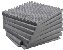
iM2875-FOAM 7 pc. Replacement Foam Set