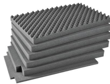
iM2950-FOAM 6 pc. Replacement Foam Set