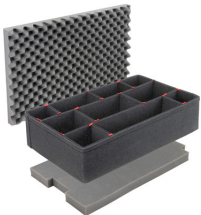
iM2950TPKIT TrekPak Case Divider Kit