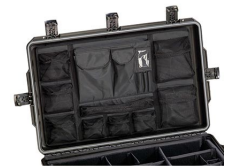
iM29XX-UTILITYORG Utility Organizer