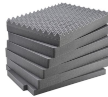
iM3075-FOAM 7 pc. Replacement Foam Set