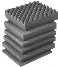
iM2275-FOAM 6 pc. Replacement Foam Set