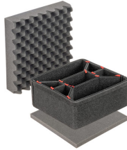
iM2275TPKIT TrekPak Case Divider Kit